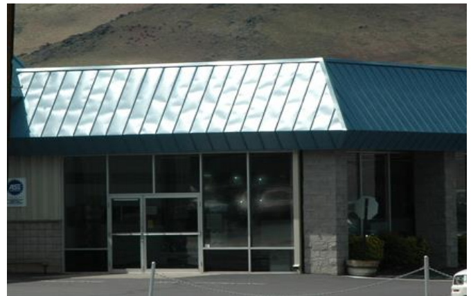
(Above and Right) These photos are minutes apart. The only difference is camera angle